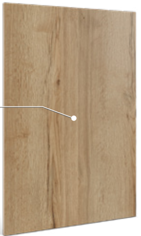
H1180 ST37 Natural Halifax Oak

This style of 5-piece door offers diverse profiles with soft, seamless edges. Doors are fabricated by applying 3D Laminate-wrapped MDF mouldings to a 1/4” thick Eurodekor TFL center panel. Multi-directional grain patterns and matching woodgrain on the back deliver a convincing real wood look. Working with trusted partners, we have developed complementary MDF door mouldings for 16 decors from the EGGER Decorative Collection.