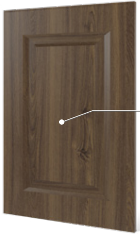
H1220 ST33 Hazelnut Tossini Elm

This seamless fabrication method mimics the look of a 5-piece door, with just one MDF panel. A door profile is routed out on the raw side of the MDF, then vacuum pressed with 3D Laminate to completely cover the panel. This process seals the edges, with no need for edge banding. Limitless profile varieties are possible, including raised or flat center panels and square or arched frames. Our partner companies offer complementary 3D Laminates for 64 EGGER decors, for an ideal match between doors and other surfaces fabricated with our matching TFL or laminates and edge banding.