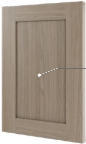
H3158 ST19 Grey Vicenza Oak

Fabricated with Eurodekor TFL and matching edge banding, this traditional style 5-piece door delivers timeless craftsmanship and an impeccable match in color, pattern and texture. The doors are fabricated with a 1/4” TFL center panel and 3/4” TFL rails and stiles. All materials are manufactured directly by us for the best possible match in color and texture.