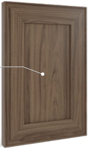
H3710 ST12 Natural Carini Walnut